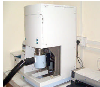
Dynamic Mech. Analyzer