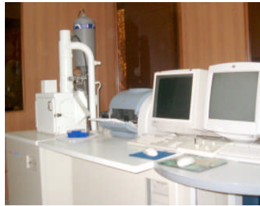
Scanning Electron Microscope