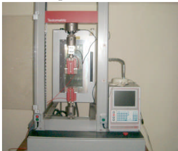
Universal Testing Machine