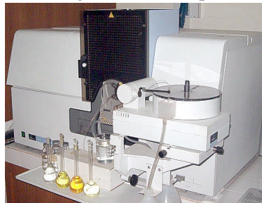
Atomic Absorption Spectrometer