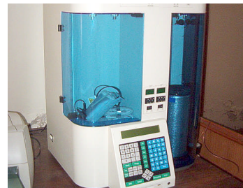
Surface Area Analyzer