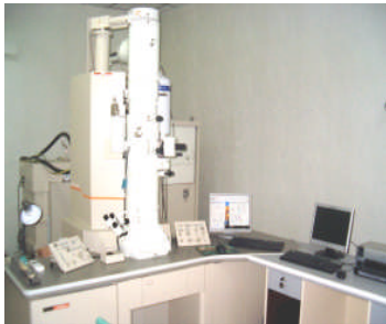
Transmission Electron Microscope

Most of these equipments are only available in CRL throughout the country or even if available are not in easy access to the users.