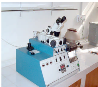
Ion Beam Thinner